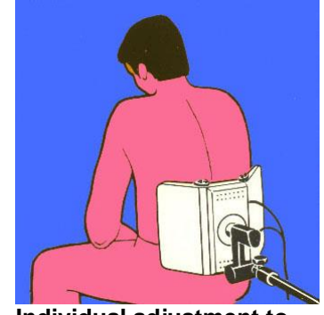
Individual adjustment to the form of the body

The breakdown of the large electrode surface into three partial areas adjustable against each other predestines the Diplode® for a multi-purpose program.